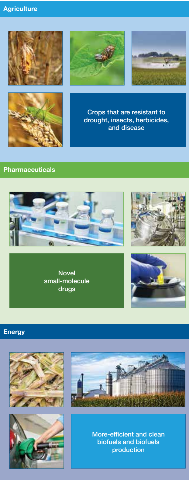
▲ Figure 1. Plant synthetic biology has many uses and applications across several industries.

Agrobacterium tumefaciens is a Gram-negative bacterium and a plant pathogen that causes crown-gall disease in some plant species. Agrobacterium transfers part of its tumor-inducing plasmid DNA, called transfer DNA (T-DNA), into plant cells through the assistance of virulence